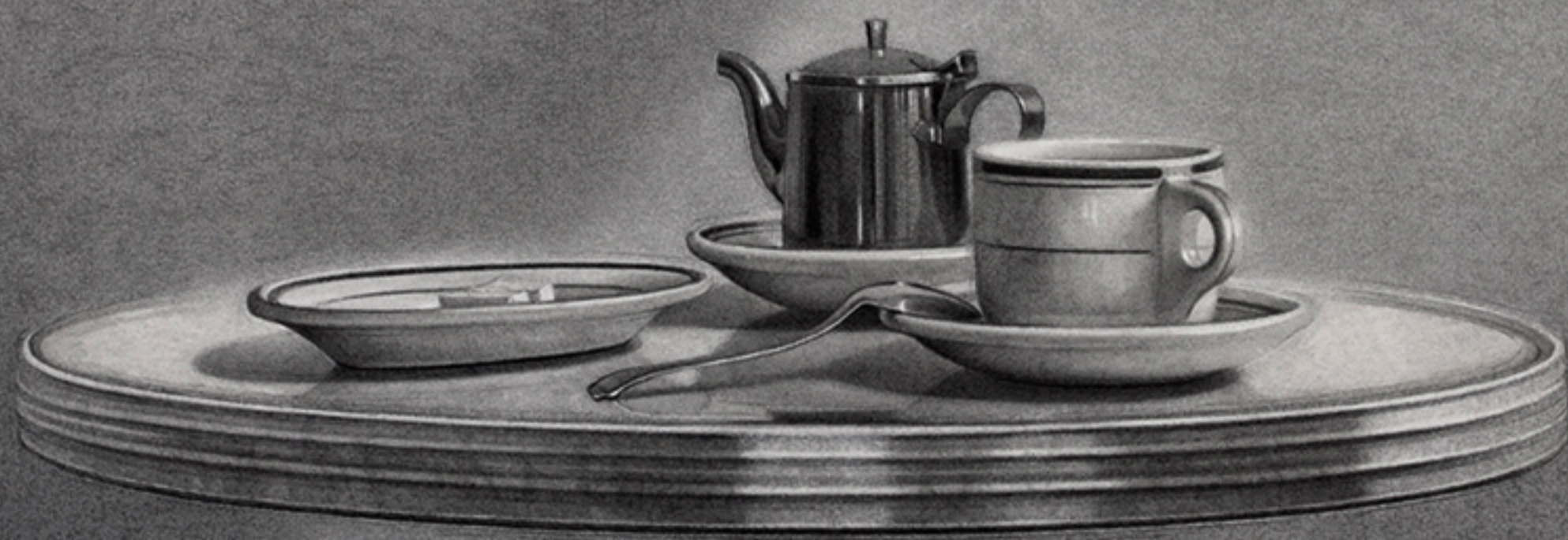
"Bistro Still Life" 2020 pencil on paper 8 1/2 x 18 in.